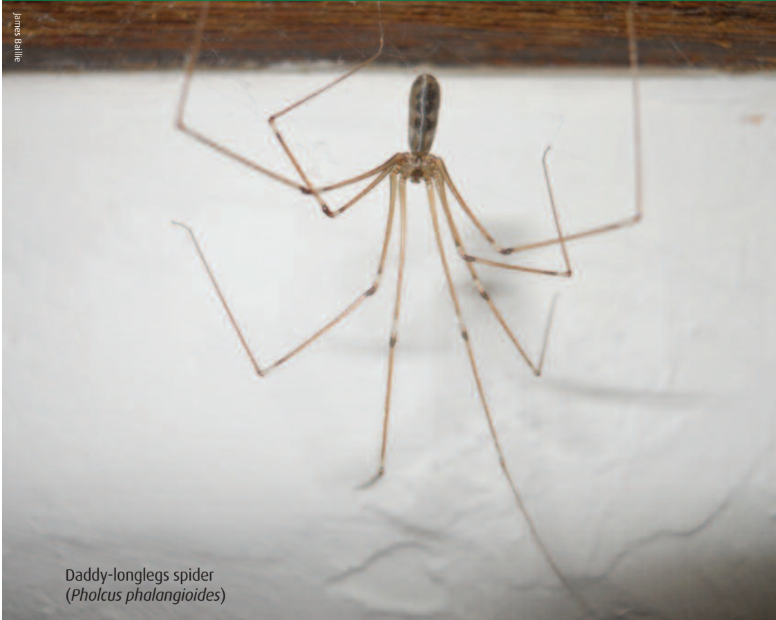
Daddy-longlegs spider ( Pholcus phalangioides )