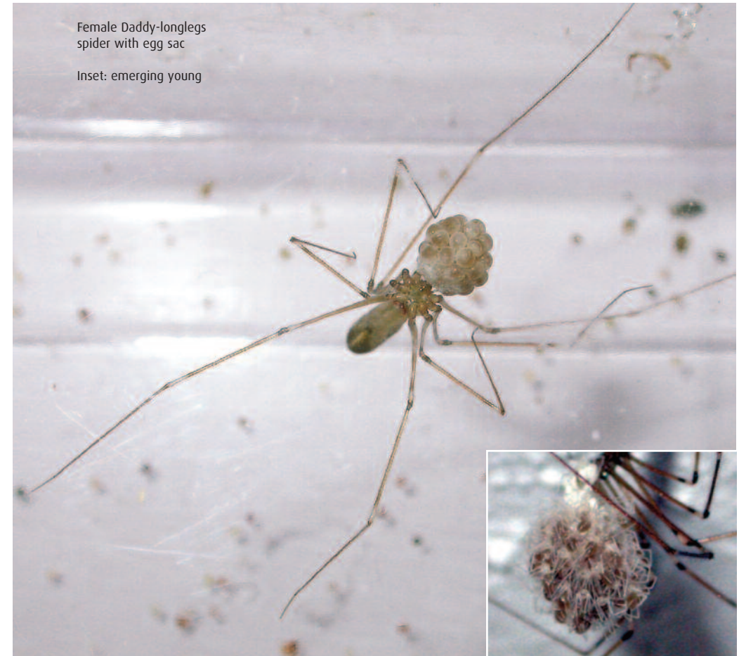
Female Daddy-longlegs spider with egg sac

The web of the Daddy-longlegs spider is an untidy tangle of non-sticky silk in which the spider usually hangs upside down. These webs are frequently found on ceilings in the corners of rooms or in little-used cupboards and can be very large. One was reported as covering a square metre of ceiling! These spiders are opportunist predators and take whatever prey comes their way - including other spiders. A study of Daddy-longlegs spiders in a Hampshire garden shed between May and September found that, of the remains of 102 prey items removed from the webs, 63 were of the Common House spider ( Tegenaria domestica ), six were other