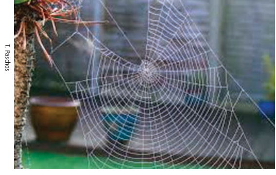
Zygiella x-notata web with the usual missing sector (above) and without the missing sector (below). Note that in the photograph below, the spider's retreat in the rolled begonia leaf (arrowed) is almost at right angles to the plane of the web.

The unique characteristic of Zygiella webs is the missing sector. Through this web-free segment runs a single silk strand (the signal line) that connects the centre of the orb-web to the spider's retreat. Here they spend the day waiting for prey to arrive; at night they can be found at the hub of the web. The reason for this particular design is that the retreat is often in almost the same plane as the web. Without the missing section the spider would have to climb across the web surface when prey arrives. The empty sector and signal line enable the spider not only to detect the arrival of prey in the web from the