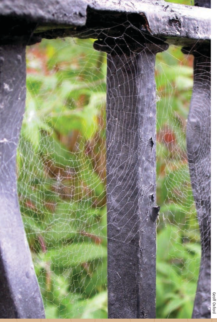
Often on structures such as these garden railings, Zygiella webs almost touch one another.