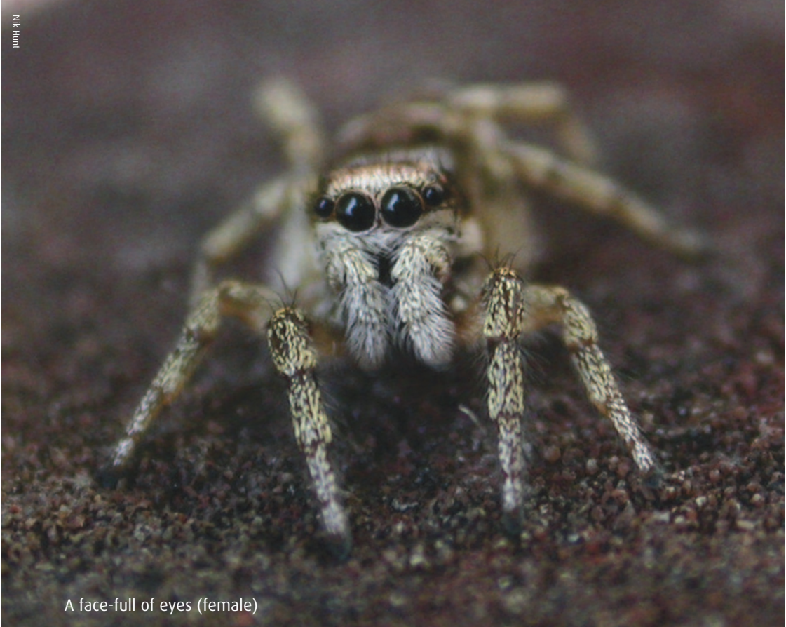
A face-full of eyes (female)

This is one of the commonest jumping spiders in Britain and can often be spotted hunting on garden walls and fences on warm sunny days.