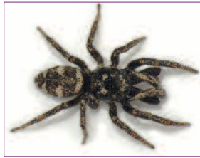
Male showing elongated chelicerae