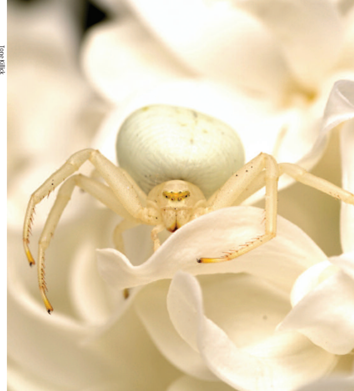
This pure white female on a white flower contrasts with the yellow female on a yellow flower in the cover image

being laid down in a dense deposit under the almost transparent cuticle. When a white mature female is placed on a yellow background, she starts to synthesise a yellow pigment between the guanine and the cuticle. Over several days she darkens progressively through creams to bright yellow. The yellow pigment can later be broken down again to reverse the colour change. The reasons for the colour change, which might seem intuitively obvious, are complex. It has been shown that Flower Crab Spiders are difficult to see at a distance for both bees (potential prey) and birds (potential