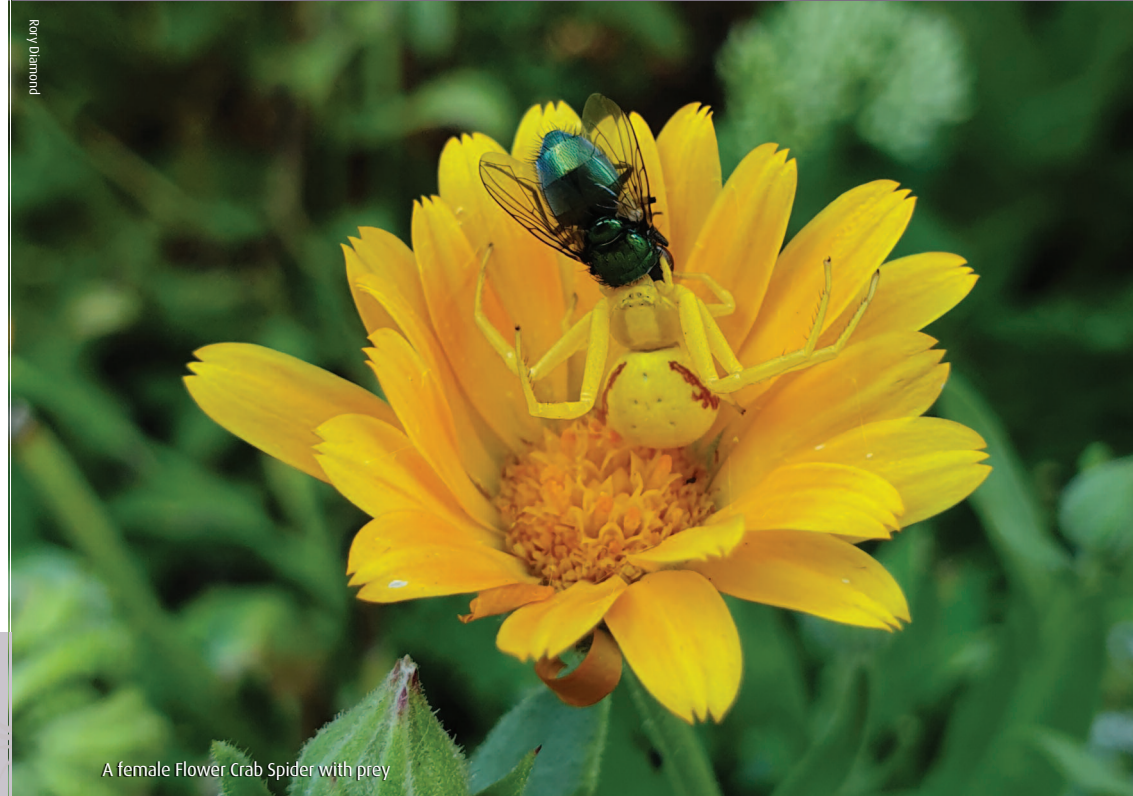
A female Flower Crab Spider with prey