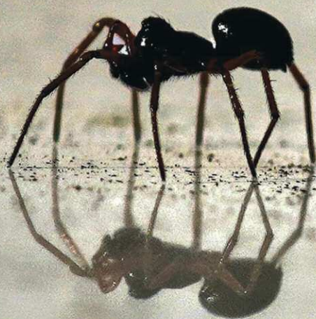
Male Erigone species

These tiny, usually black spiders, which often land on us on warm sunny days, represent over 40% of the 680 spider species recorded in Britain.