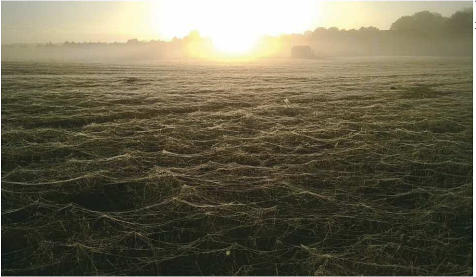
Spectacular displays of gossamer highlight the vast numbers of ballooning spiders

occasionally spiders are lifted up into the jet stream and can survive flights of thousands of kilometres. Indeed, spiders are often among the first organisms to colonise remote volcanic islands, such as Hawaii. Silk is also used for short-distance movement. Again, strands of silk are released and, blowing in the wind, snag nearby structures. The spider pulls the silk taut and walks along it to the new location – a process called rapelling. These forms of silk-assisted movement are particularly associated with Money spiders although the young of many other spider families use the same techniques.