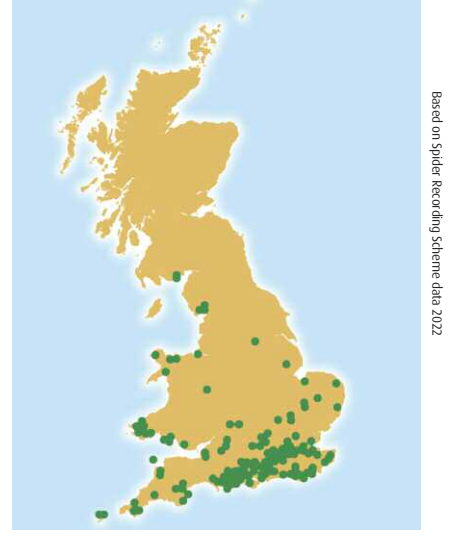
Purseweb Spider in Britain