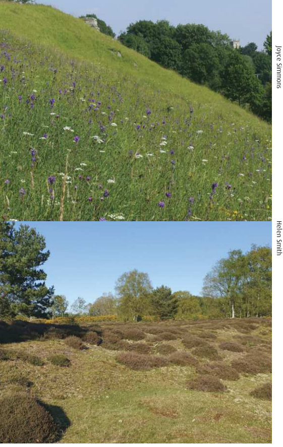
Purseweb Spiders are found in well-drained, sunny sites with loose soils - such as limestone grassland (top) and heathland (above)