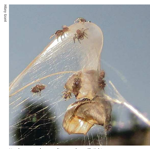
Newly emerged young disperse along silk tightropes

are enclosed in a silk sac attached to the tube wall. The young emerge in autumn but do not leave the protection of their mother's tube until spring the next year. They normally disperse in March or April and build their own miniature tube webs. However, the life cycle may be even more complex and variable than this; young have recently been recorded dispersing from a web in late autumn. They take about four years to reach maturity and can live for three or four years after that – a very long life span for a British spider.