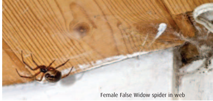
Female False Widow spider in web