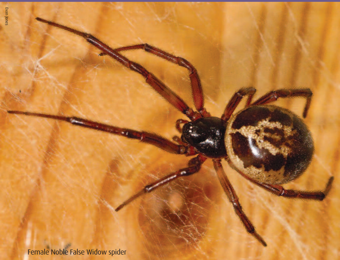
Female Noble False Widow spider

The Noble False Widow spider is a native of the Canary Islands and Madeira, now living peacefully in Britain. Dramatic tales about it sometimes appear in the media - here is the real story.