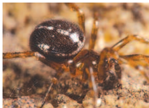
Male Steatoda bipunctata

The other two False widows commonly found are: