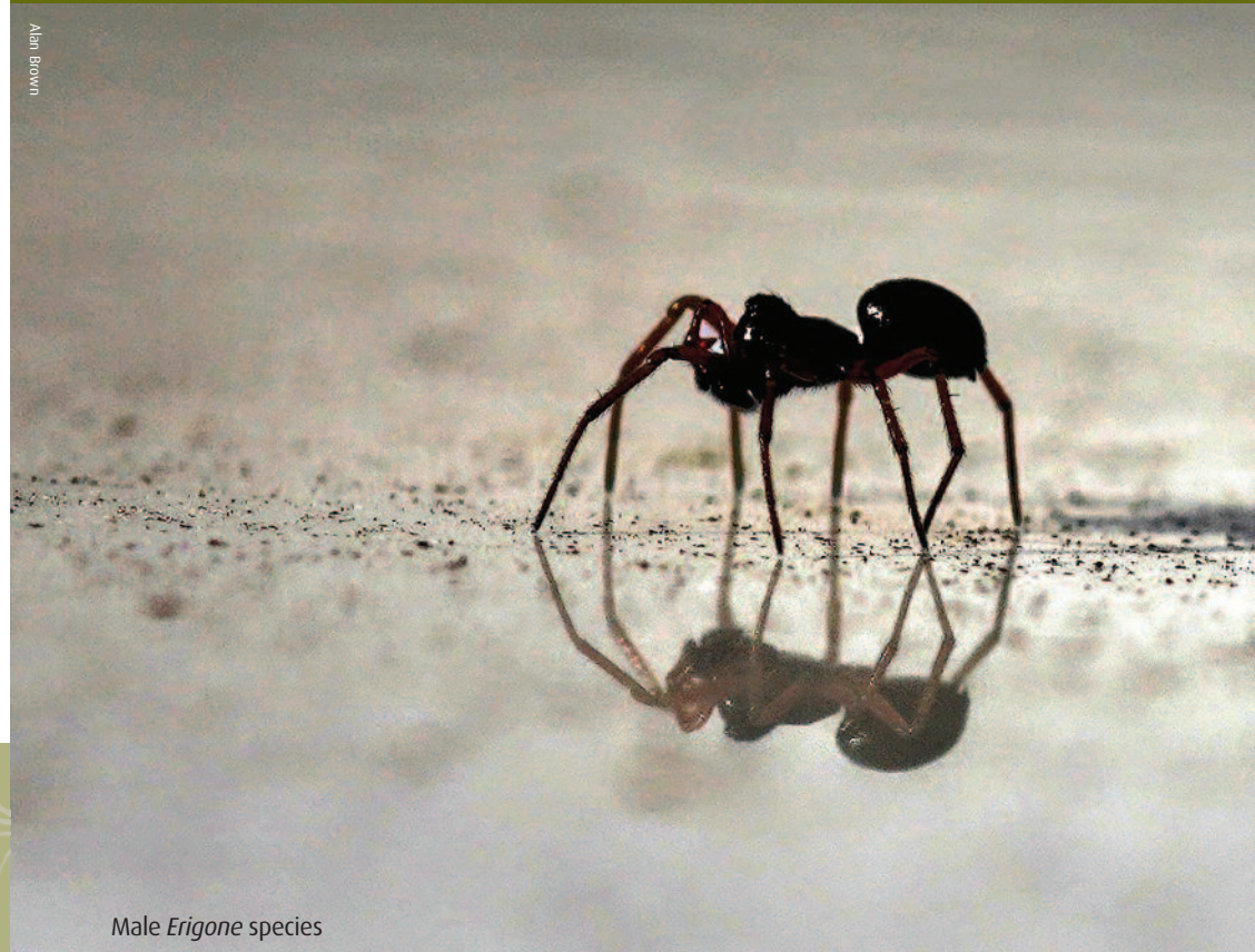
Male Erigone species