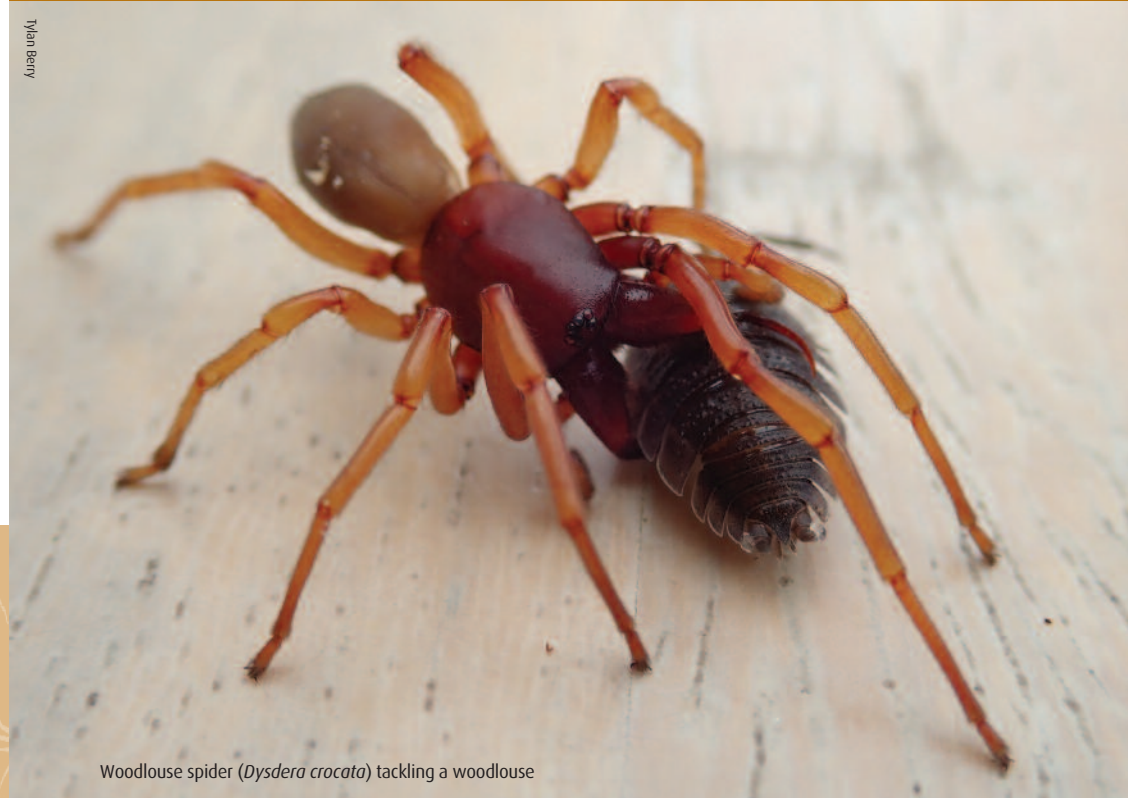
Woodlouse spider ( Dysdera crocata ) tackling a woodlouse

Known for their impressive, long, curved fangs and diet of woodlice, our two species of these distinctive, orange-coloured spiders with a tubular abdomen are also known as 'baked bean' spiders.